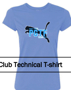
Club Technical T-shirt

Optional Club swag is available online to order.